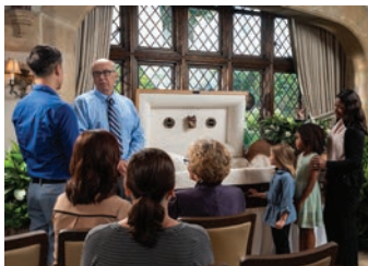
VISITATION AND CEREMONY

The ceremony is a way to tell your loved one's story and celebrate their life.