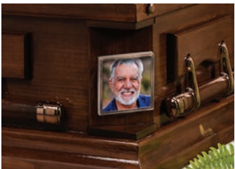
INDIVIDUAL & UNIQUE