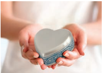
HOLD & TREASURE